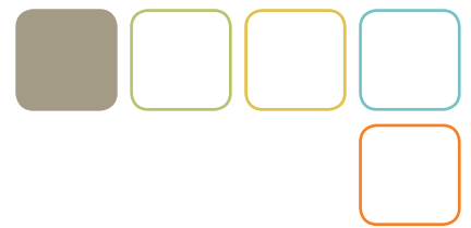
Table C: Invalid applications